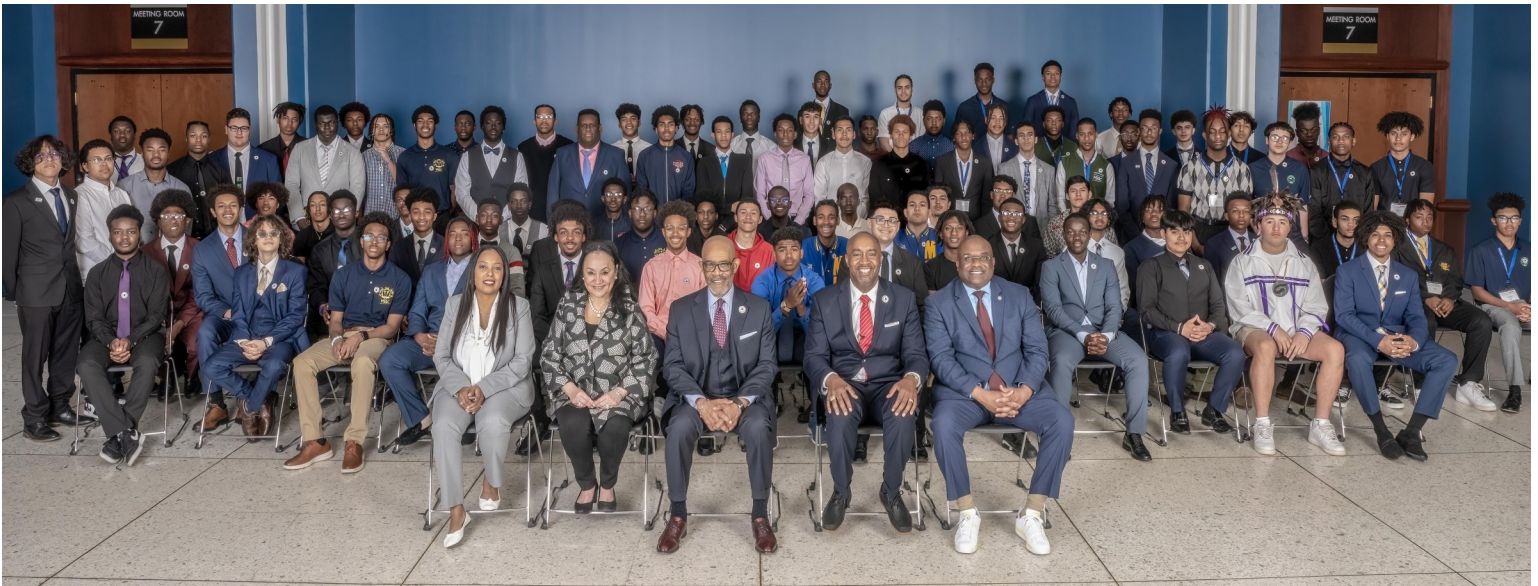
2023 NYSMBK Fellows