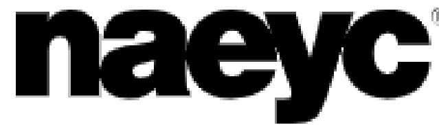
NAEYC Dual Language Learners Page