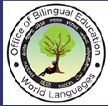
NYS Office of Bilingual Education and World Languages (OBEWL)