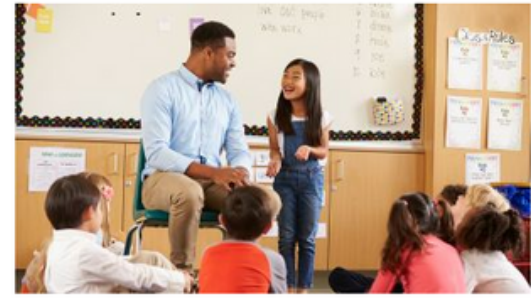
NYS Office of Early Learning