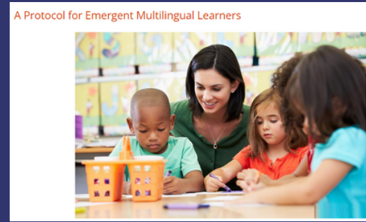
NYS EMLs in PreK Programs