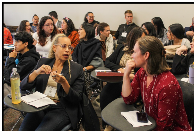
Attendees “talk and turn” during one of the Voices United break-out sessions