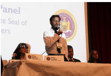
Recent New York State High School Graduates share and reflect on their experiences learning English and receiving the New York State Seal of Biliteracy (NYSSB)