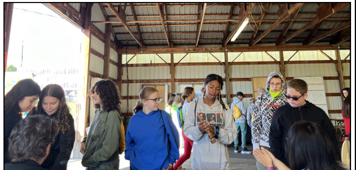
Wayne County students meet with Mid-West RBERN Staff to discuss career choices