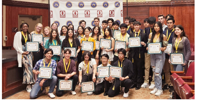
2024 NYSSB Graduates from Ossining High School

In 2023-24, more than 10,600 students from about 500 schools earned the New York State Seal of Biliteracy (NYSSB). Each year, the number of schools that offer this award has grown by about 15%. In 2024-25, we anticipate about 575 schools will sign on to offer the Seal of Biliteracy.