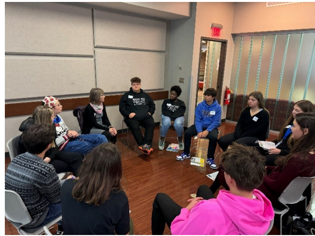
Students in Buffalo engage with ESOL and Bilingual professionals in a push to fill the Teacher Pipeline.

Over the next decade, New York State is projected to need 180,000 new teachers, highlighting the critical importance of careers in education. In response, Erie 1 BOCES, in partnership with local school districts and higher education institutions, hosted the 3rd Annual Careers in Education Conference . This one-day event welcomed nearly 200 high school juniors and seniors from 18 school districts to explore the diverse opportunities within the education field.