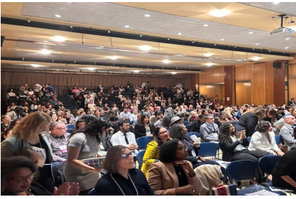
Nearly 300 attendees participate in Voices United 2024 at Fordham University