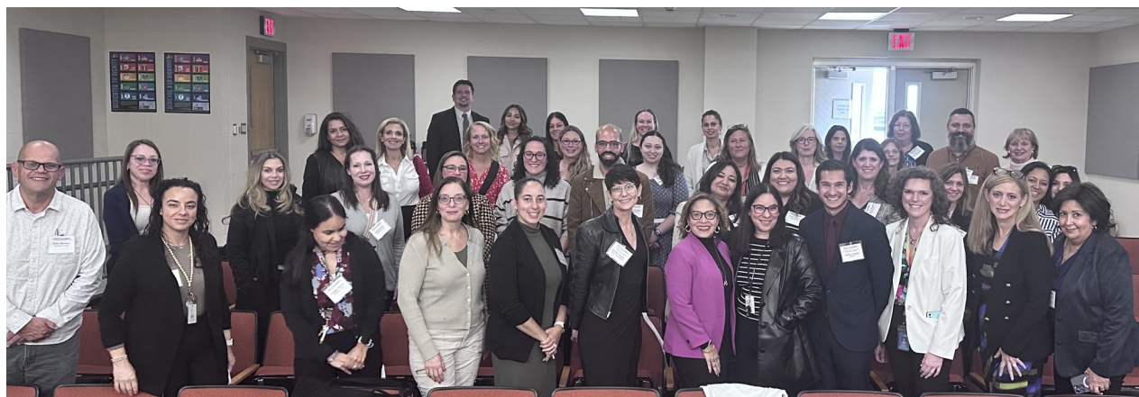
Attendees of the Long Island Teacher Town Hall